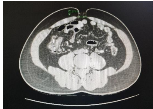
图 1 术前 CT 显示脐疝缺损

环内脂肪组织, 分离出假疝囊 (部分患者), 显露脐环缺损 (图 2D), 间隙分离至右侧腹直肌后鞘前间隙 (图 2E), 创建足够大小的间隙 (四周均超过缺损边缘 5 cm), 2-0 倒刺线连续缝合关闭脐环 (图 2F), 如遇腹膜破损、Hemolock 夹闭腹膜破口或可吸收缝线缝合关闭破口。选用大博医疗沃尔德补片 (15 cm × 15 cm, 聚丙烯材料) 修剪至合适大小, 经穿刺孔置入腹膜前间隙, 完整覆盖所创建腹膜前间隙 (图 2G), 腹膜前留置引流管 1 根经切口边缘引出并接负压引流球, 排气、退出腹腔镜及器械, 取出单孔穿刺器, 2-0 薇莽连续缝合腹外斜肌腱膜, 3-0 薇莽间断缝合皮下组织, 4-0 快薇莽间断缝合皮肤。